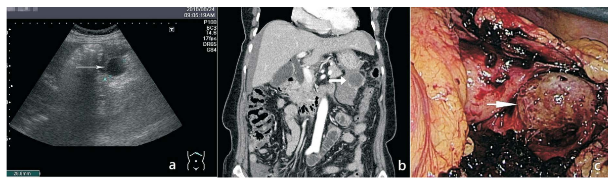
Figure 1. (a) A cystic lesion with 2.88 cm in diameter located in the left upper quadrant abdomen area with posterior acoustic enhancement. (b) CTA showed one 2.5 cm cystic lesion (arrow) with extravasation of contrast medium abutting greater curvature of the stomach. (c) A 3 cm cystic tumor (arrow) between greater curvature and splenic flexure of colon.

filled with blood. AFH in low-magnification microphotography originated from omentum is showed in H-E stain at 10x (Figure 2D). A thick fibrous pseudo-capsule with hemosiderin deposition is also observed. Pericapsular cuffing of lymphoplasmacytic cells is occasionally seen (Figure 2). The spindle or histiocytoid cells are CD99 (+), CD68 (focal+), CD31 (focal+), smooth muscle actin (SMA) (focal+), CD34 (-), ERG (-), HHV-8 (-), epithelial membrane antigen (EMA) (-), CK (AE1/AE3) (-), and desmin (-) (Figure 3). The morphology and immunoprofile are most consistent with that of an angiomatoid fibrous histiocytoma (AFH).